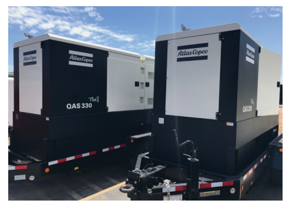
Portable & Standby Generators