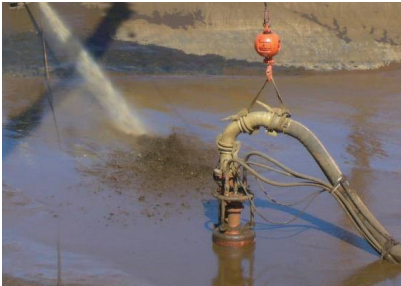
Hydraulic Power Packs & Submersible Pumps