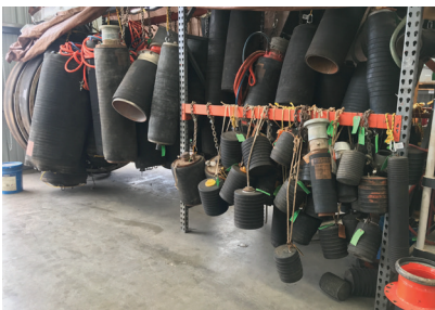
Pipe plugs, Vacuum, Joint & Mandrel Testers