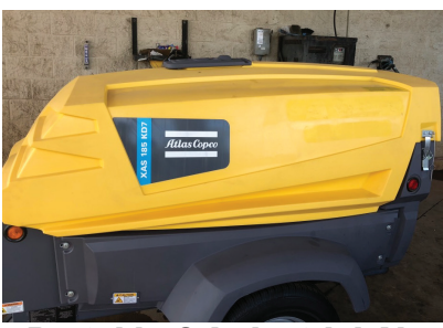
Portable & Industrial Air Compressors