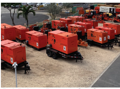
Dri-Prime Pumps for Sewer Bypassing & Dewatering