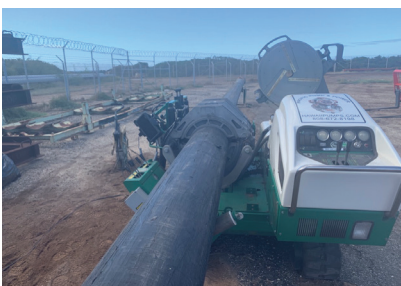
HDPE Fusion Equipment and Training